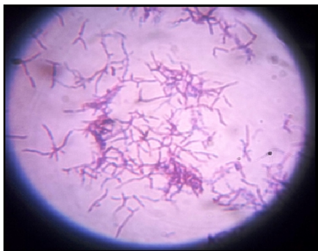
Fig. 3: Gram's stain from culture