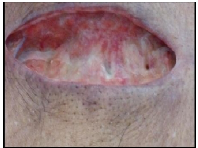
Fig. 1: Surgical wound infection

On examination the sternal sutures were open, there was 3inch dehiscence, and the subcutaneous tissue was infected Fig 1. Pus swabs sent from the wound site which grew a dry powdery, white colony at the end of 72 hours. He had a wound debridement on 04.03.15 and started with Tab Cefum 500mg BD.