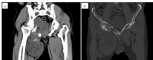
Figure 1: a: Non contrast CT Coronal reformatted image soft tissue window of pelvis; b: Non contrast CT Coronal reformatted image bone tissue window of pelvis