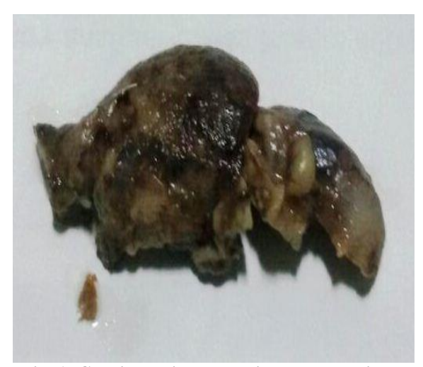
Fig. 1: Grayish white appendicectomy specimen approximately 5 cm in length