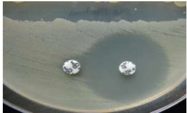
Fig. 4: Neg Phenotype