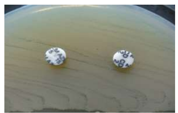
Fig. 5: R Phenotype