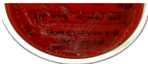
Fig. 1: Blood agar showing small shiny 1-2 mm diameter convex colonies with slight hemolysis