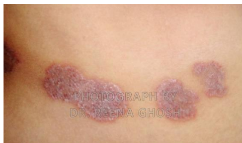
Fig. 3: Tinea corporis on right lateral aspect of abdomen. Lesions are raised and erythematous caused by Trichophyton mentagrophyte var quinckeanum