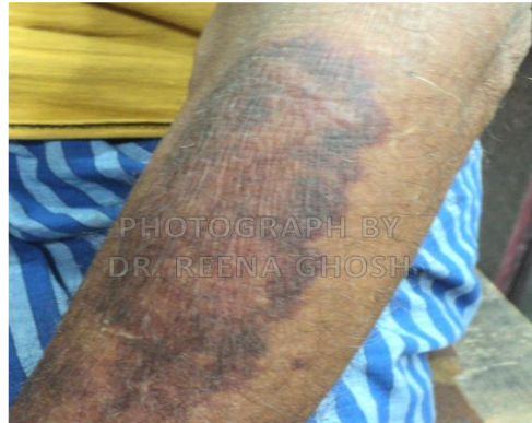
Fig. 2: Tinea corporis. Plaque like lesion. The outer ring is infiltrated and has a red rolled border with a few vesicles. The remaining surface of the lesion is smooth, firm, infiltrated and plaque like