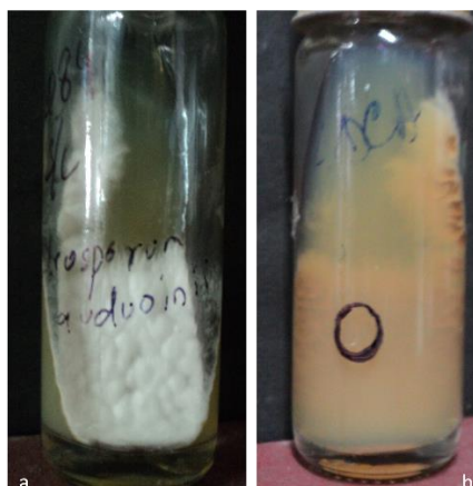
Fig. 5: Colony morphology of Microsporium audouinii grown on SDCA, a) obverse b) reverse