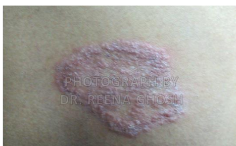
Fig. 1: Tinea corporis. Psoriasiform lesion. Silvery scales covered this infiltrated maculopapular area. Some vesicles are evident in several places on the surface. The periphery was quite erythematous and inflamed