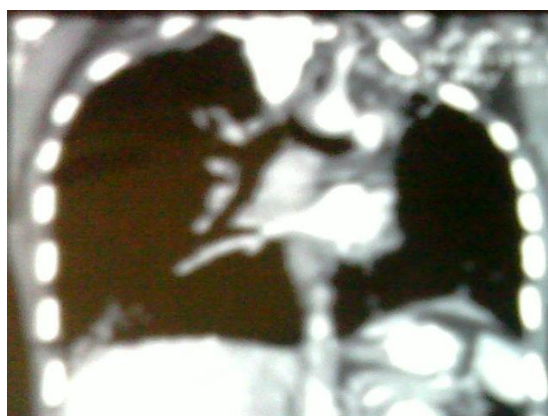
Fig. 4(a): Coronal CT of chest showing absence of cyst with residual air filled cavity lesion and surrounding consolidation in the right lower lobe