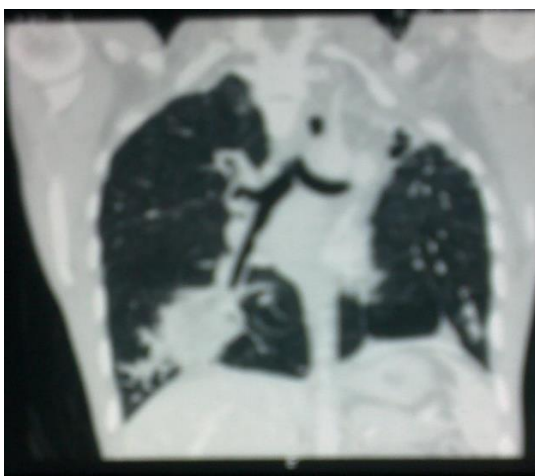
Fig. 2(a): Coronal CT of chest (lung window) showing well-defined cystic lesion in the right lower lobe