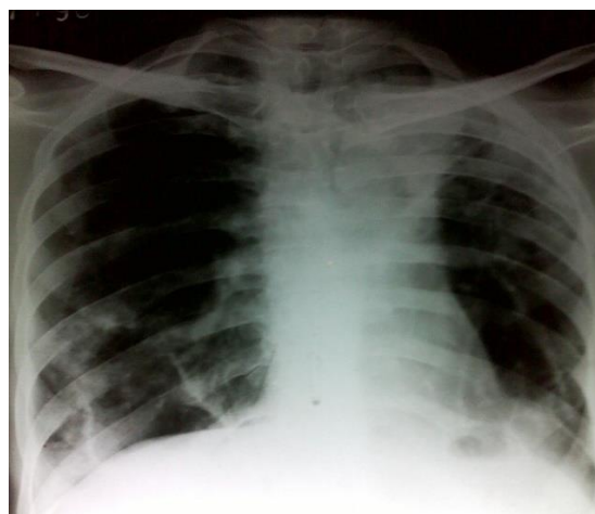
Fig. 3: Repeat chest X ray PA view showing a cavitating lesion in the same region indicating complete evacuation of cyst into the bronchus