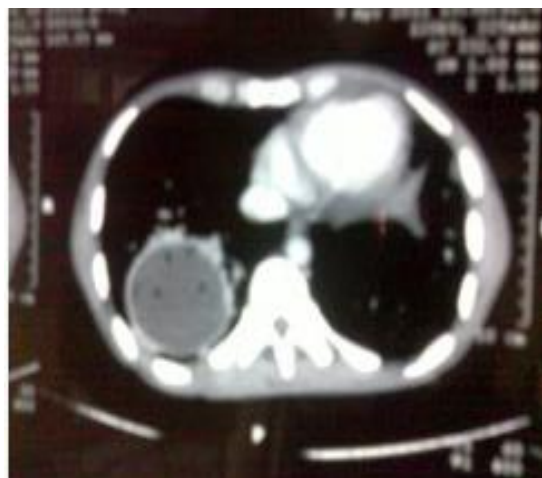
Fig. 2(b): Axial CT of chest (mediastinal window) showing a homogenous rim enhancing cystic lesion with few air bubbles in the right lower lobe