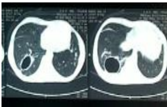
Fig. 4(b): CT axial section shows a large spherical air-filled cavity in the same region following evacuation