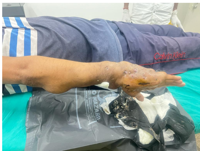
Fig. 1: Clinical case presenting multiple discharging sinuses with serosanguineous exudates and black grains.

was prescribed Septran and Itraconazole. The patient had no relief and his symptoms worsened. He went to Jaipur government hospital in 2019 where they prescribed the same Itraconazole medications. The swelling later involved his whole right hand and wrist joint. The patient is unable to perform daily functions using his right hand. The patient came to our hospital in June 2022 Physical examination revealed multiple discharging sinuses with serosanguineous exudates and black grains (Figures 1 and 2), located on the dorsum of the right hand and wrist. Swelling and local erythema were present, lymph nodes were not palpable. The swelling in the forearm was around 15 x 12 cm in size with no erythema or sinus tracts. The patient complained of constant mild pain which is relieved by pain medications.