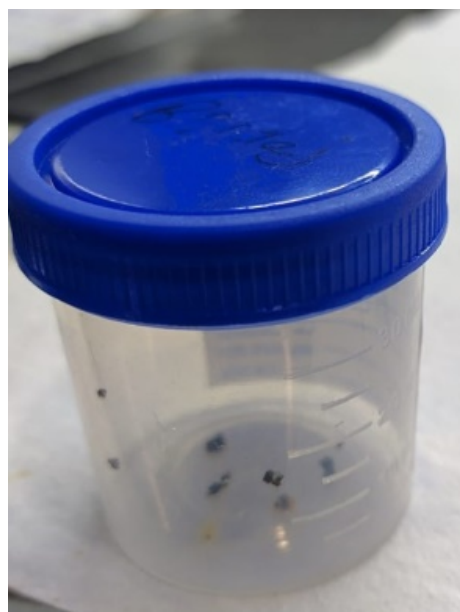
Fig. 2: Black grains received in laboratory

Radiological evaluation by computed tomography showed multiple lytic lesions with cortical destruction in the right distal radius, distal ulna, metacarpal, and