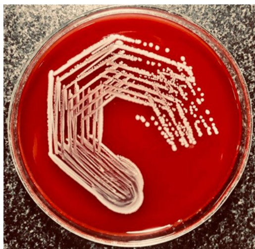
Fig. 3: Sheep blood agar showing greyish colonies with slight tint of yellow