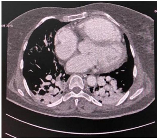
Fig. 1: Computed tomography (CT) scan of chest showing bilateral lower lobar consolidations with air bronchograms.