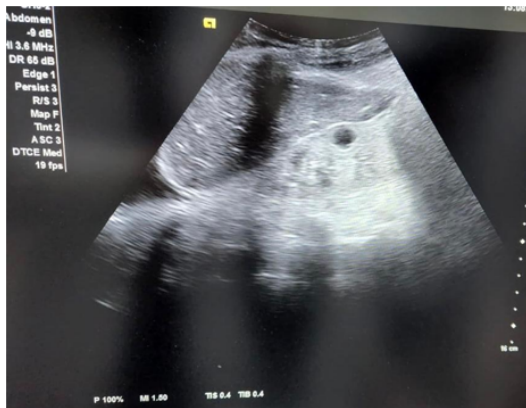
Fig. 2: Ultrasound image showing small right kidney with increased parenchymal echogenicity with complete loss of corticomedullary differentiation and small cortical cyst in mid portion