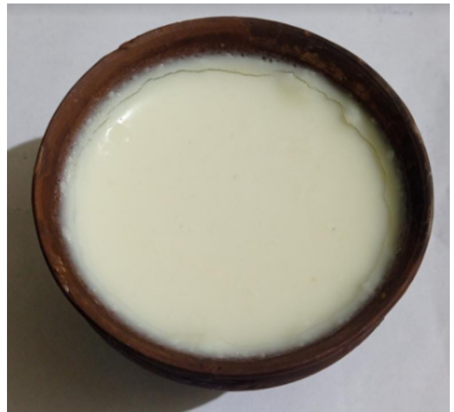
Fig. 1: Picture of curd

People with lactose intolerance should not be given milk-based probiotics. Because microbes used as probiotics already exist naturally in our body, probiotic foods and supplements are generally safe. However, they may trigger allergic reactions, and may also cause mild stomach upset, diarrhoea, or flatulence and bloating for the first few days after starting to take them. 34