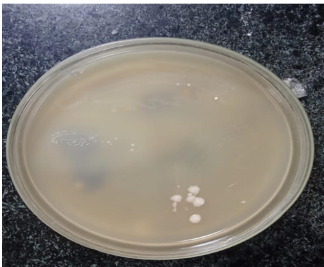
Fig. 5: Lactobacillus colonies on Tomato Juice agar

Most common pathogenic bacterium in curd samples was Escherichia coli , followed by Enterococcus and Staphylococcus spp., Candida kefir and Wickerhamomyces anomalus (earlier Pichia anomala ) were also commonly found as pathogens in curd samples.