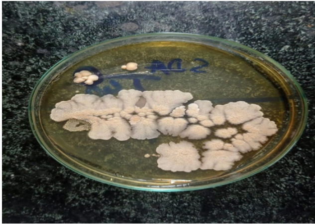
Fig. 3: Bacillus colonies