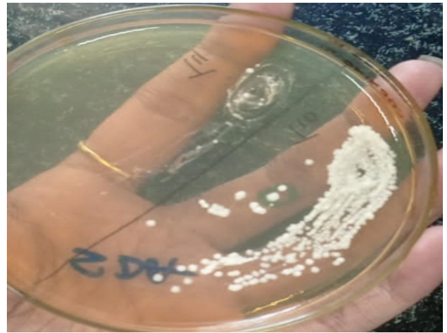
Fig. 6: Candida colonies from curd samples