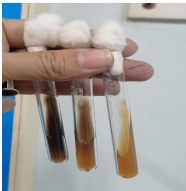
Fig. 8: Aesculin hydrolysis in Enterococcus faecalis (extreme left tube)