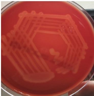
Fig. 1: Growth of streptococcus pseudoporcinus on blood agar.

bilateral air entry was equal, bilateral extensive crepitations were present. Her blood sample was sent for routine hematological investigations. The diagnostic test results are displayed in Table 1.