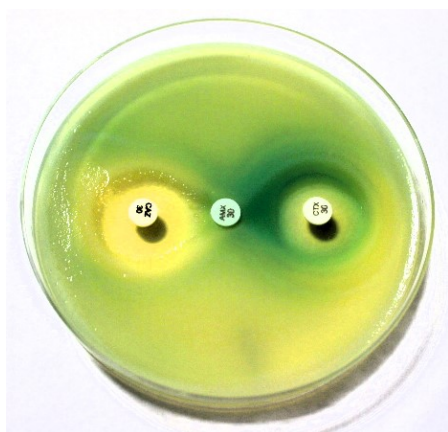
Figure 3: Double disk diffusion test for phenotypic detection of \beta lactamase enzyme production.

amber class C AmpC genes in phenotypic and genotypic tests. Likewise, there was a marginal difference in the genotypic test. Some strains of P. aeruginosa did not contain the \beta -lactamase genes, which initially identified the phenotypic test. Hence, based on the current findings, we can confirm that the CSOM patients were infected with P. aeruginosa strains, ESBL, MBL, AmpC producers, and carbapenem producers or, in other words, PAN drug resistance bacteria. A study from Odisha, India, isolated 371 MDR P. aeruginosa strains from CSOM patients who were resistant to antibiotics, particularly the \beta -lactam group. 32 Similarly, from South India, from 106 CSOM patients, 49 MDR P. aeruginosa strains are isolates highly resistant to \beta -lactam and carbapenem group of antibiotics. 33 ESBL P. aeruginosa strains were isolated from CSOM patients from a study in North India, which accounted for 36% of the total infections. 34 Similarly, in another Indian study, it was reported that ESBL-producing P. aeruginosa strains accounted for nearly 41.2% of the total infection, which was spread across all patients in each group. 35