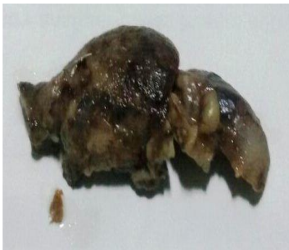
Fig. 1: Grayish white appendicectomy specimen approximately 5 cm in length