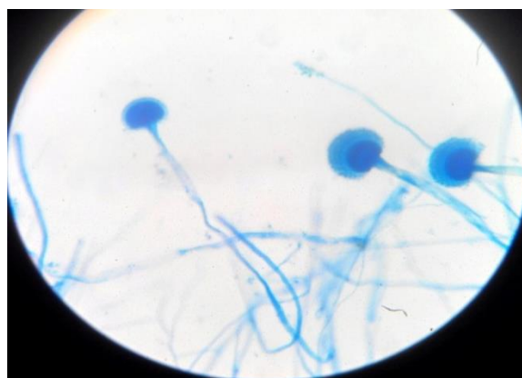
Fig. 2: LPCB showing Aspergillus fumigatus