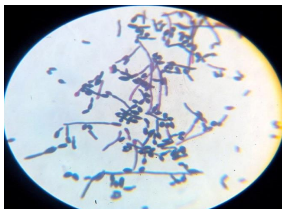
Fig. 1 :Gram Staining showing Candida albicans