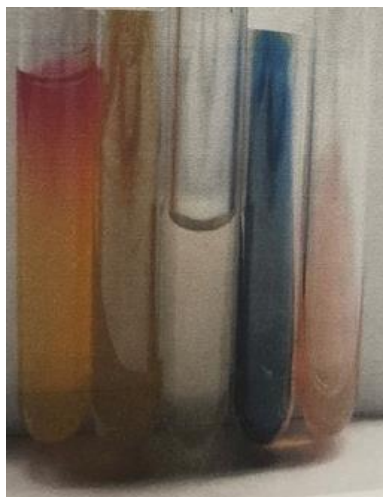
Fig. 4: Biochemical tests for identification