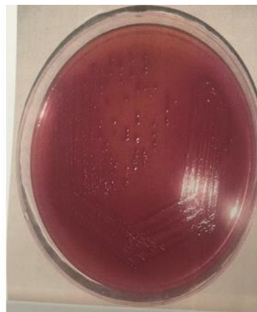
Fig. 1: Enterobacter isolate on MacConkey Agar